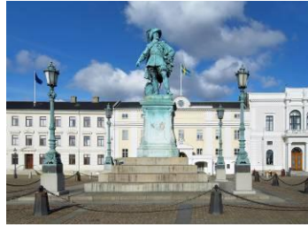
King Gustav II Monument