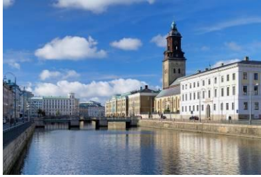
Big Harbor Canal