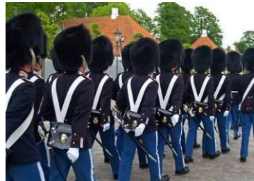
Changing of the Guard