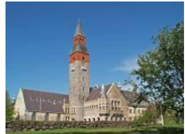
Finnish National Museum

Board your private motorcoach with your Tour Guide for a tour of this Nordic capital. Visit Senate Square with its imposing Lutheran Cathedral , the city's impressive Orthodox Cathedral , and the 1920's-era rail station designed by Eliel Saarinen, featuring artwork ground out of huge granite blocks. Pass by the Esplanadi shopping street with its nice boutiques and cafés, and see the ultra-modern architecture of Finlandia Hall and the city's Opera House . Visit the " Rock Church ", actually built out of a rock pit, the National Parliament building, and the Olympic Stadium , built for the 1952 Summer Olympics hosted by Finland.