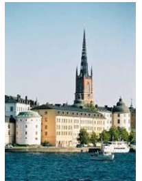
Views of Gamla Stan from Stockholm Harbor, old alleyways & shopping streets