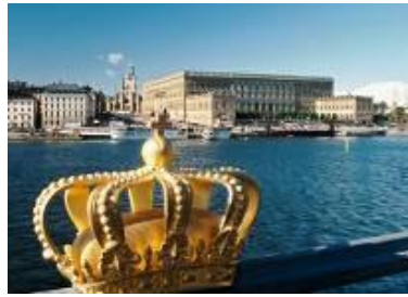
Swedish Royal Palace