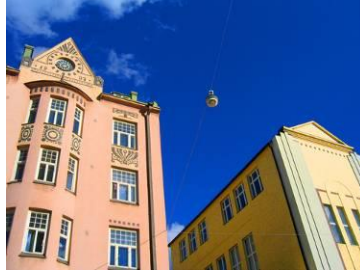
Art Nouveau Apartments