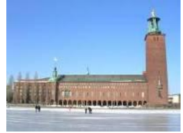
Stockholm City Hall

Witness Stockholm's many canals as you tour the city. Visit the imposing and towering City Hall where you will see the stunning mosaic-lined Golden Hall with thousands of golden tiles and the Blue Hall where the annual Nobel Prize banquet is held. Climb the tower for great views of central Stockholm. View the Parliament and the larger-than-life Royal Palace , that is ideal for an in-depth tour later on during your visit to Stockholm. A brief stop at Gamla Stan , the oldest part of the city, will give you a taste of the Stockholm of centuries past. Conclude your introduction to the city at your hotel where you will check in.