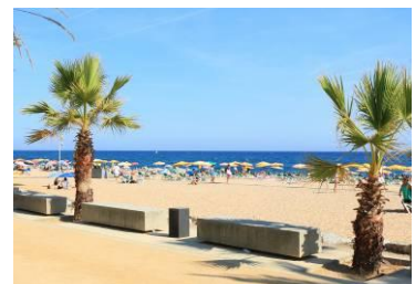
Costa del Maresme