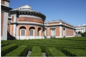
El Prado Gardens