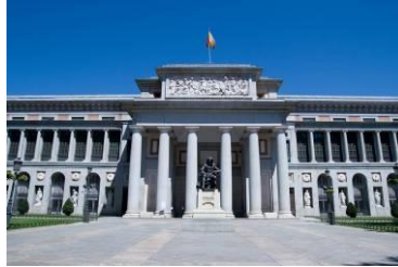
El Prado Museum