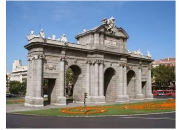
Puerta de Alcalá

Enjoy a guided tour of Madrid for an overview of this wonderful city's most important sights.