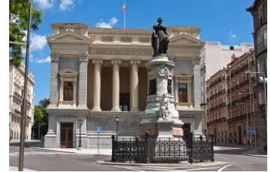
Casón del Buen Retiro

Visit one of the world's premier art museums. Approximately 1,300 of El Prado's 20,000+ works are available for viewing (the rest are in storage or on loan to other museums). Many of the best-known pieces of Spain's and Europe's most famous artists, such as El Greco , Diego Velázquez , and Francisco Goya are displayed here, often with entire rooms dedicated to one artist.