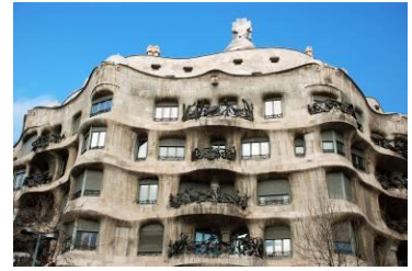
Casa Mila (La Pedrera)

Depart your hotel on your private motorcoach for a City tour of Barcelona with your English-speaking Guide. View some of the city's most important sites, including Montjuic Mountain's Olympic facilities from the 1992 summer games. Continue on to Barri Gotic in the city's center for a walking tour of the main sights including the Cathedral and Placa del Rei . Free time on La Rambla pedestrian boulevard for shopping and taking a break at one of the street's many cafés.