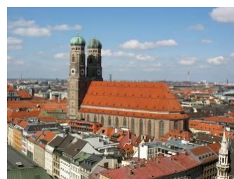
Cathedral of Our Dear Lady

Walk around Marienplatz in Munich's Old Town to take in the medieval flavor of this historic site including the imposing medieval Neues Rathaus (New Town Hall) and Church of St. Peter . Watch the 12-minute long Glockenspiel (carillon) show by painted wooden characters playing out a medieval storyline on the side of the Town Hall and climb its 275-foot tall tower for great views of the city. Visit the Viktualienmarkt , a large food market known for its quality products with pubs, beer halls, and restaurants nearby.