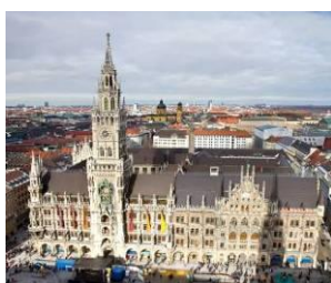
New Town Hall

Morning Free time to experience Munich's sights. Visit the Old Town and nearby attractions.