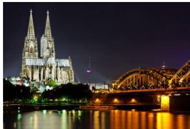
Cathedral & Rhine River