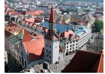
Old Town Skyline

Board your private motorcoach with English-speaking guide to visit northern Munich and its main attractions.