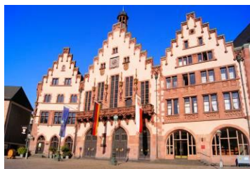
Romer Town Hall