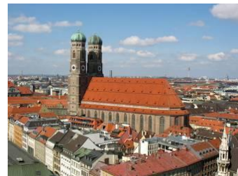
Cathedral of Our Dear Lady

Walk around Marienplatz in Munich’s Old Town to take in the medieval flavor of this historic site including the imposing medieval Neues Rathaus (New Town Hall) and Church of St. Peter . Watch the 12-minute long Glockenspiel (carillon) show by painted wooden characters playing out a medieval storyline on the side of the Town Hall and climb its