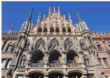
New Town Hall Façade