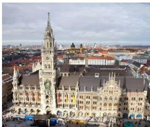
New Town Hall

Afternoon Free time to experience Munich’s sights. Visit the Old Town and nearby attractions.