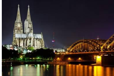
Cathedral & Rhine River