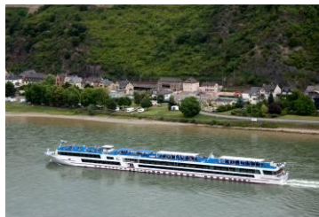
River Cruise Boat