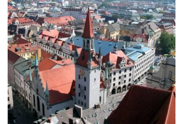
Old Town Skyline

Board your private motorcoach with English-speaking guide to visit northern Munich and its main attractions.