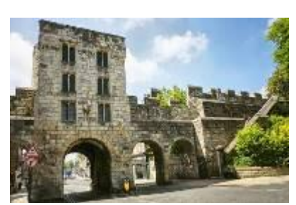
Medieval City Walls