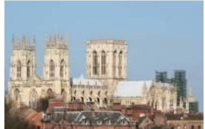
York Minster Panorama