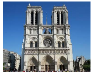
Notre Dame Cathedral