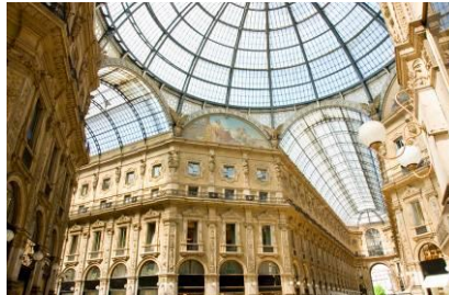
Vittorio Emanuele II Gallery