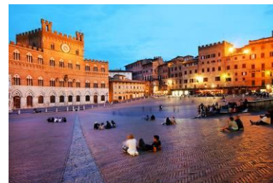
Relaxing on the Piazza

Travel to Siena , Italy's best preserved medieval city filled with fine examples of Gothic architecture. View Piazza del Campo , a very unusual central plaza shaped like a shell with scalloped edges. Walk along the small medieval streets and admire wonderful buildings. Visit the interior of the Cathedral and the Museo dell'Opera Metropolitana .