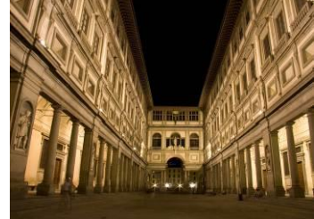
Uffizi Gallery by Night

Take this opportunity to visit two of the most famous museums in the world.