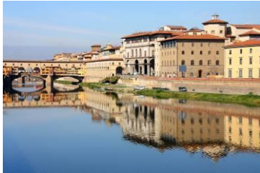
Uffizi Gallery on Arno River