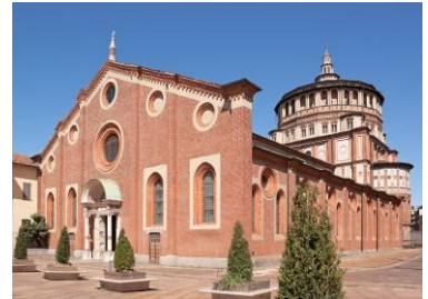
Santa Maria delle Grazie

Walking tour of Milan's most important sites, including La Scala , one of the world's most famous opera houses, the breathtaking Duomo , the city's large and impressive Gothic cathedral and the Vittorio Emanuele II Gallery with shops, restaurants and cafés. The tour also includes a guided visit to " The Last Supper ", the renowned painting by Leonardo da Vinci , located in the Convent of Santa Maria delle Grazie .