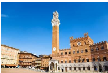
Piazza del Campo