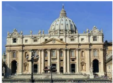
St. Peter's Basilica

Please Note: Visitors in shorts or sleeveless tops are not admitted to churches and Vatican Museums.