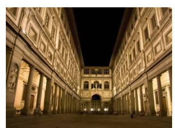
Uffizi Gallery on Arno River