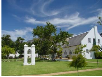
Spier Wine Estate