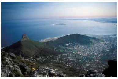
View of Table Bay