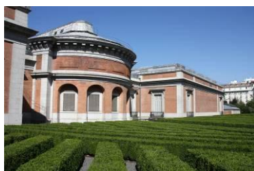
El Prado Gardens