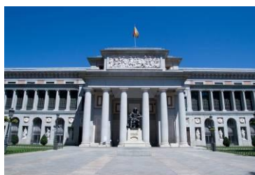
El Prado Museum