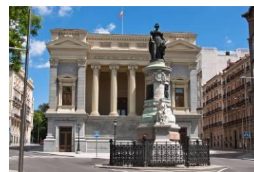
Casón del Buen Retiro

Visit one of the world's premier art museums. Approximately 1,300 of El Prado's 20,000+ works are available for viewing (the rest are in storage or on loan to other museums). Many of the best-known pieces of Spain's and Europe's most famous artists, such as El Greco , Diego Velázquez , and Francisco Goya are displayed here, often with entire rooms dedicated to one artist.