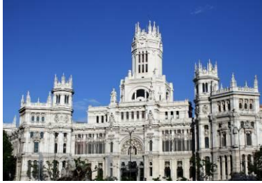
Palacio de Cibeles