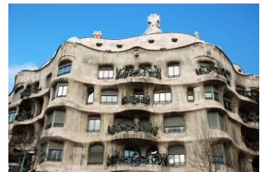
Casa Mila (La Pedrera)

Depart your hotel on your private motorcoach for a City tour of Barcelona with your English-speaking Guide. View some of the city's most important sites, including Montjuic Mountain's Olympic facilities from the 1992 summer games. Continue on to Barri Gotic in the city's center for a walking tour of the main sights including the Cathedral and Placa del Rei . Free time on La Rambla pedestrian boulevard for shopping and taking a break at one of the street's many cafés.