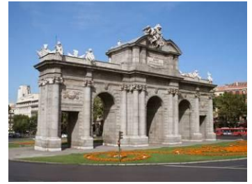
Puerta de Alcalá

Enjoy a guided tour of Madrid for an overview of this wonderful city's most important sights.