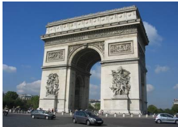
Arc de Triomphe