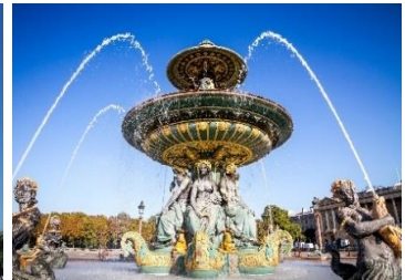
Place de la Concorde