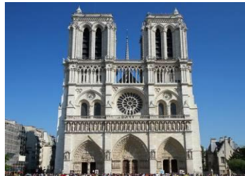
Notre Dame Cathedral