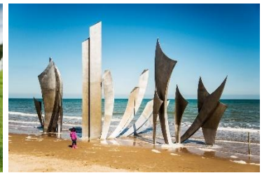
Omaha Beach Memorial

Transfer from Paris to visit landmarks marking the sacrifices of American and Allied servicemembers in the World War II landings on the beaches of Normandy on June 6, 1944.