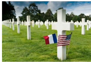
American Military Cemetery