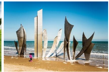
Omaha Beach Memorial

Transfer from Paris to visit landmarks marking the sacrifices of American and Allied servicemembers in the World War II landings on the beaches of Normandy on June 6, 1944.