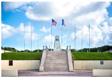
Utah Beach Memorial