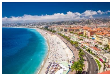
Castle Hill View