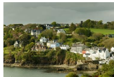
Killarney Seaside Houses

Killarney Outlets & Blarney Woollen Mills - Shop for high-quality woollen clothing at a discount.