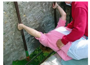
Kissing the Blarney Stone

Transfer to one of Ireland's iconic sights, the Blarney Castle where you will have an opportunity to literally bend-over-backwards to kiss the Blarney Stone and be blessed with the gift of gab !