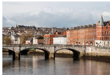
St. Patrick's Bridge/River Lee