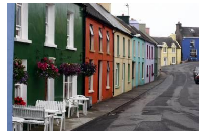
West Cork Houses